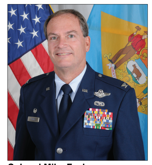
Colonel Mike Feeley

The deployment also prepares Col. Feeley as an alternate for a possible future deployment as the deputy director of mobility forces for U.S. Air Forces Central Command.