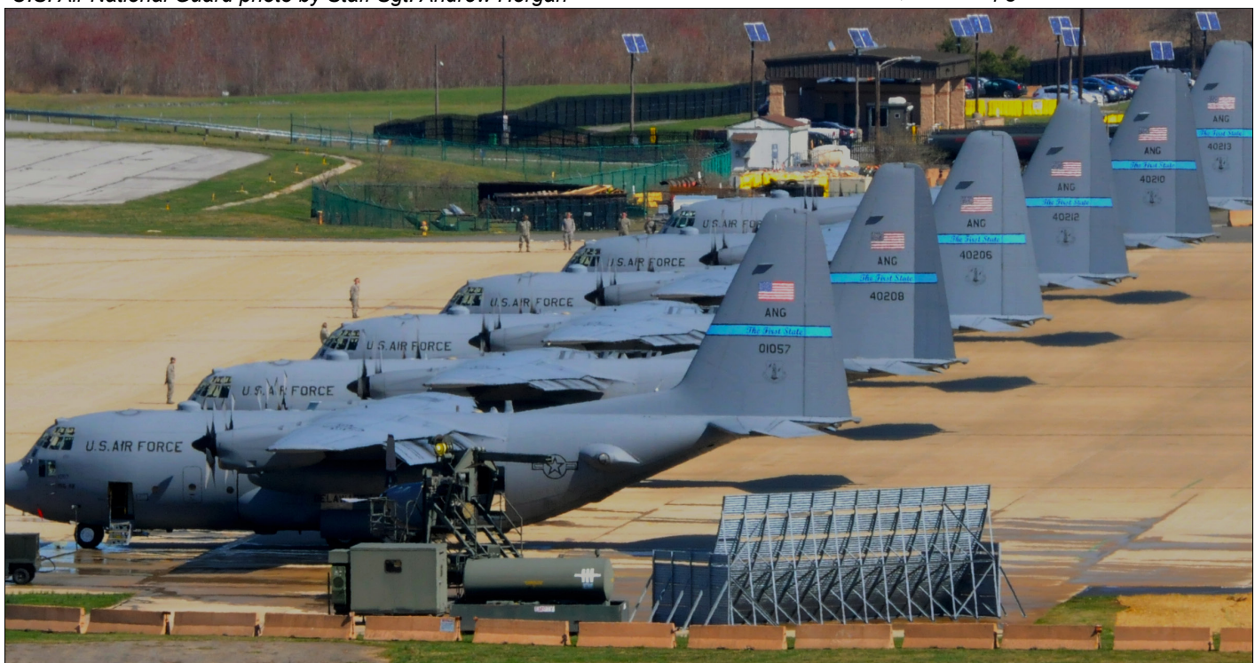
Six out of the eight of the 166th Airlift Wings C-130H aircraft that are slated for navigational system and cockpit upgrades.