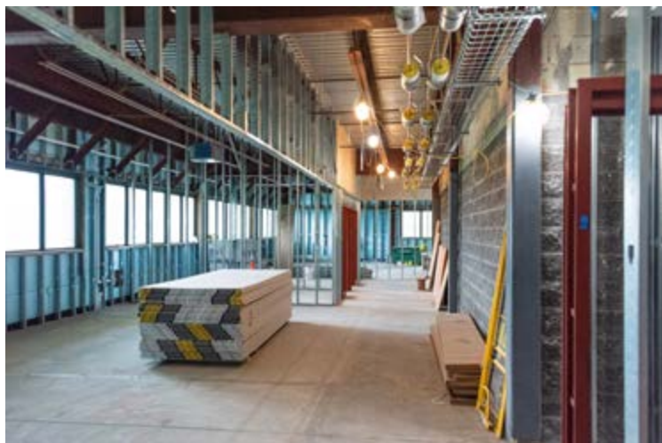
The first floor hallway is ready for drywall.