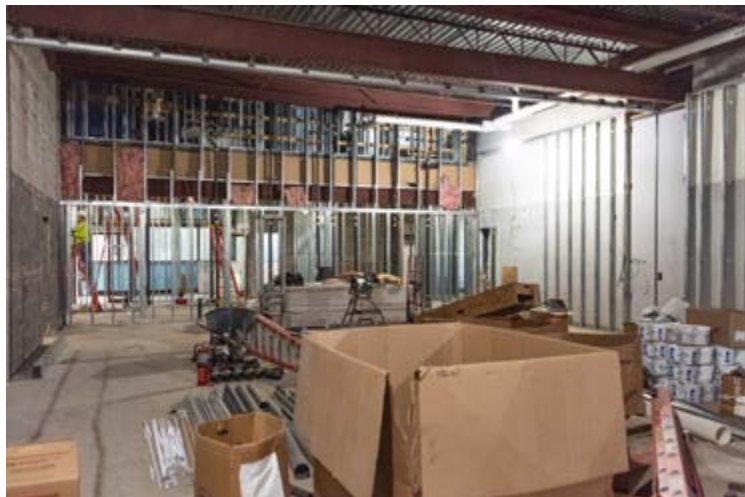
The Loeffel Room gets a make-over.