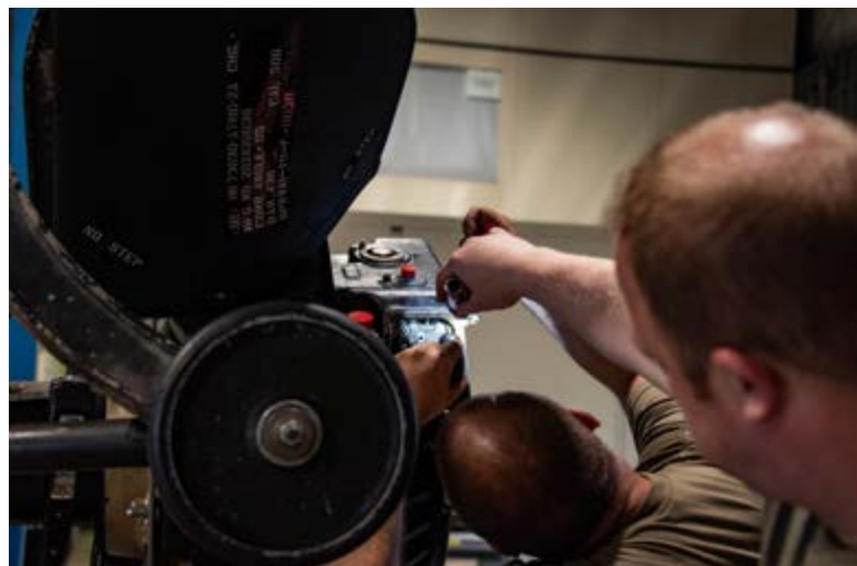
Airmen from the 166th Maintenance Group (MXG) propulSION section prepare a C-130 Hercules propeller for installation on 4-May-2022. MXG technicians are the backbone of the 166th Airlift Wing's flight operations, keeping the birds in the air and mission-ready.

As many of you know, the entire fleet of C-130 aircraft with 54H60 propellers were grounded last fall when cracks were discovered in the propeller barrel. With no timeline or get-well date in sight, the recovery plan started off with little answers to our numerous questions. Mission capability rates and flying hours plummeted as units waited for a recovery plan to be developed. The fight was on with units to replace damaged 54H60 barrel assemblies with green ones.