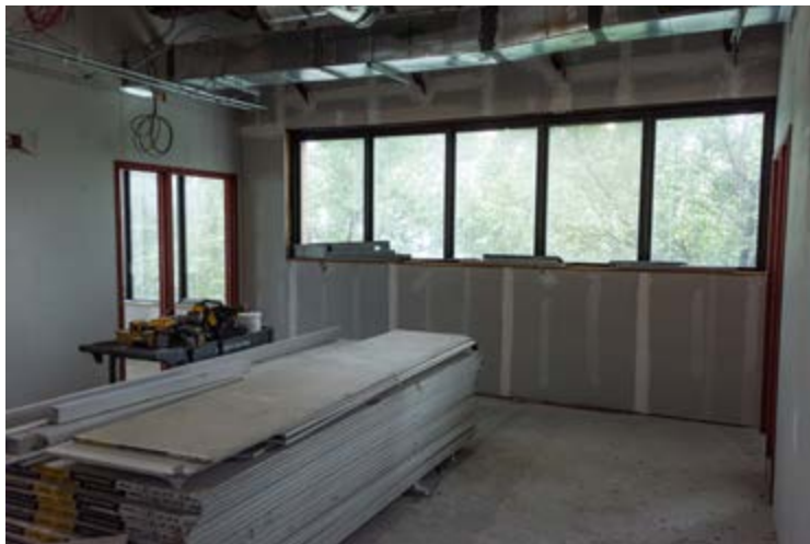
The command suite takes shape.