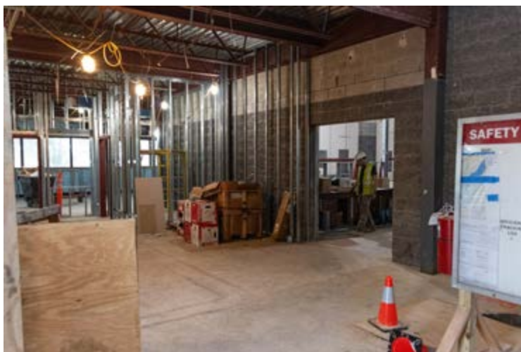
Downstairs looking toward the FSS.