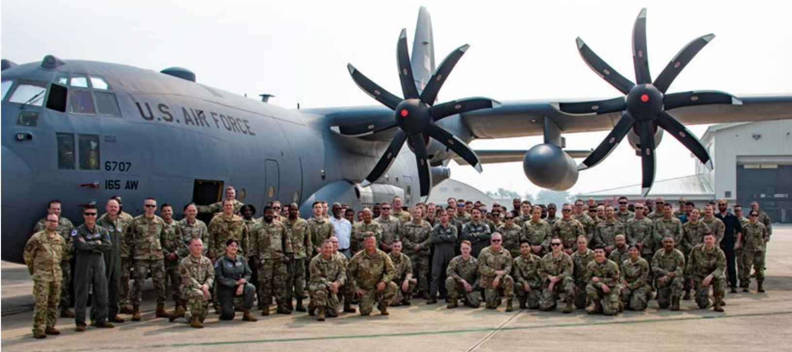
NEW CASTLE AIR NATIONAL GUARD BASE, Del. -- Members of the 166th Airlift Wing answer the commander's call to commemorate the arrival of the first C-130H3 aircraft, 29-June-2023. The Delaware Air National Guard will be receiving six additional H3 models to replace its fleet of H2.5 models. Significant differences between the two models can be found in the eight-bladed carbon fiber propellers and in the avionics packages.