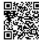
TedTalk QRC Code