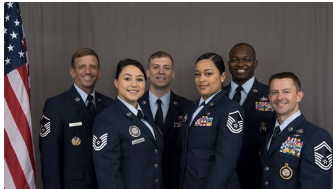
The DANG Recruiting Team