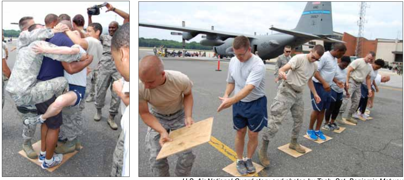
U.S. Air National Guard story and photos by Tech. Sgt. Benjamin Matwey

The wing's base-wide Wingman Day and Safety Stand Down with a theme of 'Mission focus for mishap prevention' was held Sunday, July 13. Hands-on activities were the norm from hoop throws and football tosses to a display of new and vintage motorcycles with a safe riding briefing. Airmen participated in activities where teamwork and collaboration were key. Airmen moved through hula-hoops as their group locked hands, or had to maintain group balance while perched on a small square, or worked together to move with speed and unity of effort using wood squares as stepping stones.