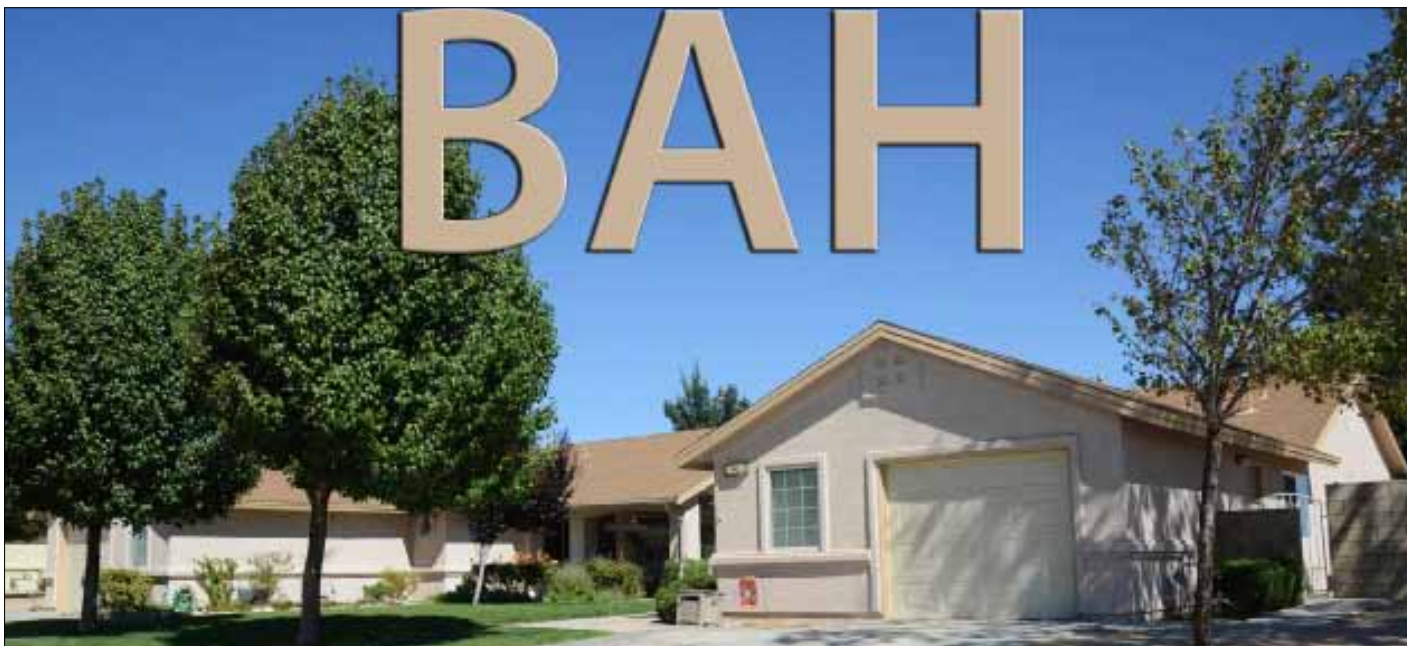
U.S. Air Force graphic