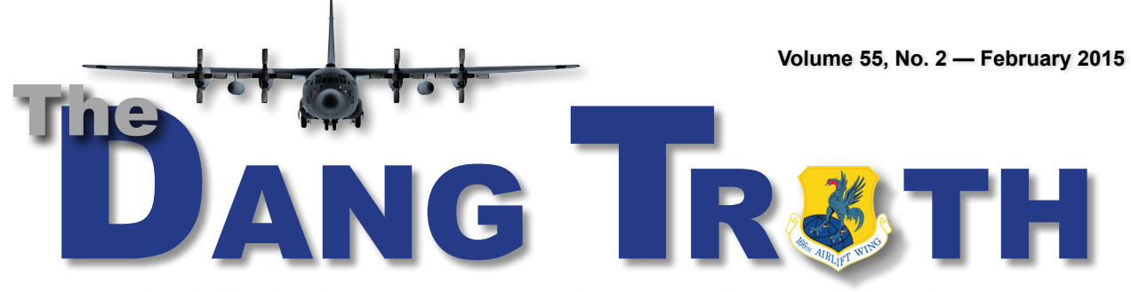
166th Airlift Wing, Delaware Air National Guard - New Castle ANG Base, Delaware