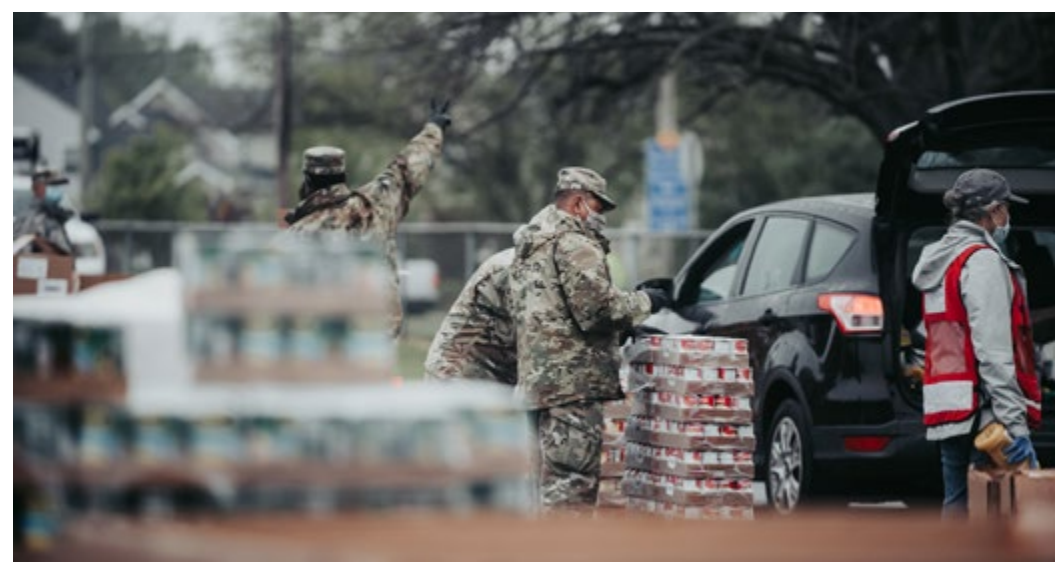
Delaware National Guard assists the Food Bank of Delaware - Newark, DE (22-May-2020)

For more 166th Airlift Wing news and photos, please visit: www.166aw.ang.af.mil For more DE National Guard news and photos, please visit: www.de.ng.mil