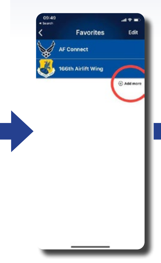
2. Tap on "Add more" then select "166th Airlift Wing"