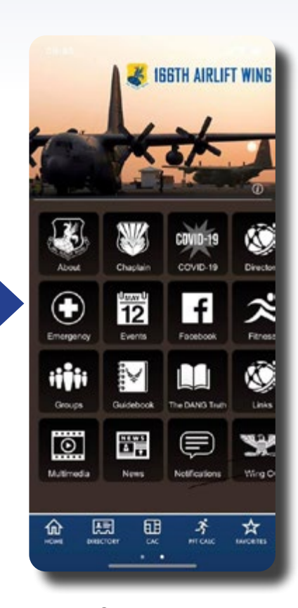
3. See these tiles appear that point to important links