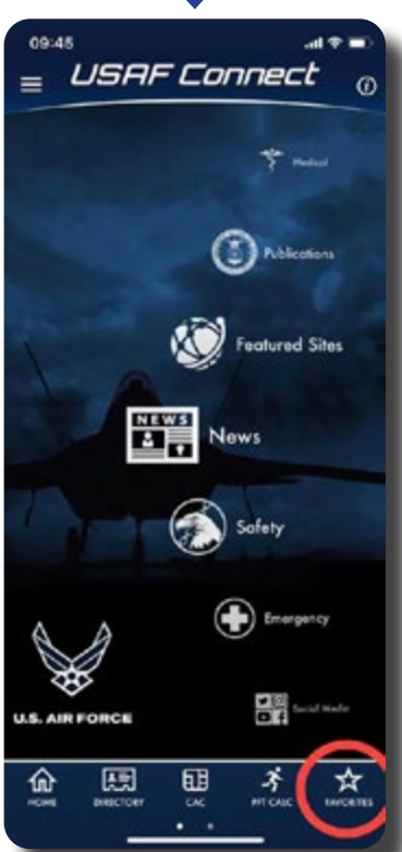
1. Tap on "FAVORITES"